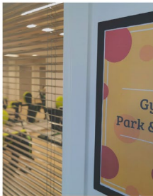
Emeliehemmet's new HUR gym