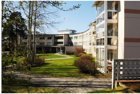
Emeliehemmet, senior housing